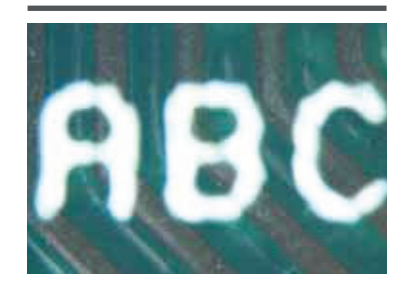
0.7mm text before DotStream Technology™ 2 passes, 58 seconds

0.7mm text with DotStreamTechnology™1 pass, 26 seconds